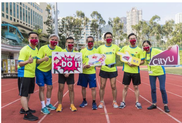
Convocation unites fellow alumni to serve the local community.