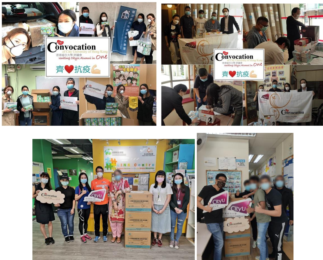
Convocation unites fellow alumni to extend the caring spirit to the community.

Promoting caring culture has been a mission of the Convocation. In view of the epidemic, SC members raised funds from alumni, sourced anti-epidemic products and distributed them to people in need through collaboration with 22 social welfare organisations in the 1 st and 4 th quarters of 2020.