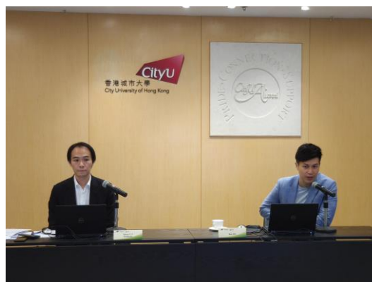
Alumni participants learn useful tips on managing investment tools.