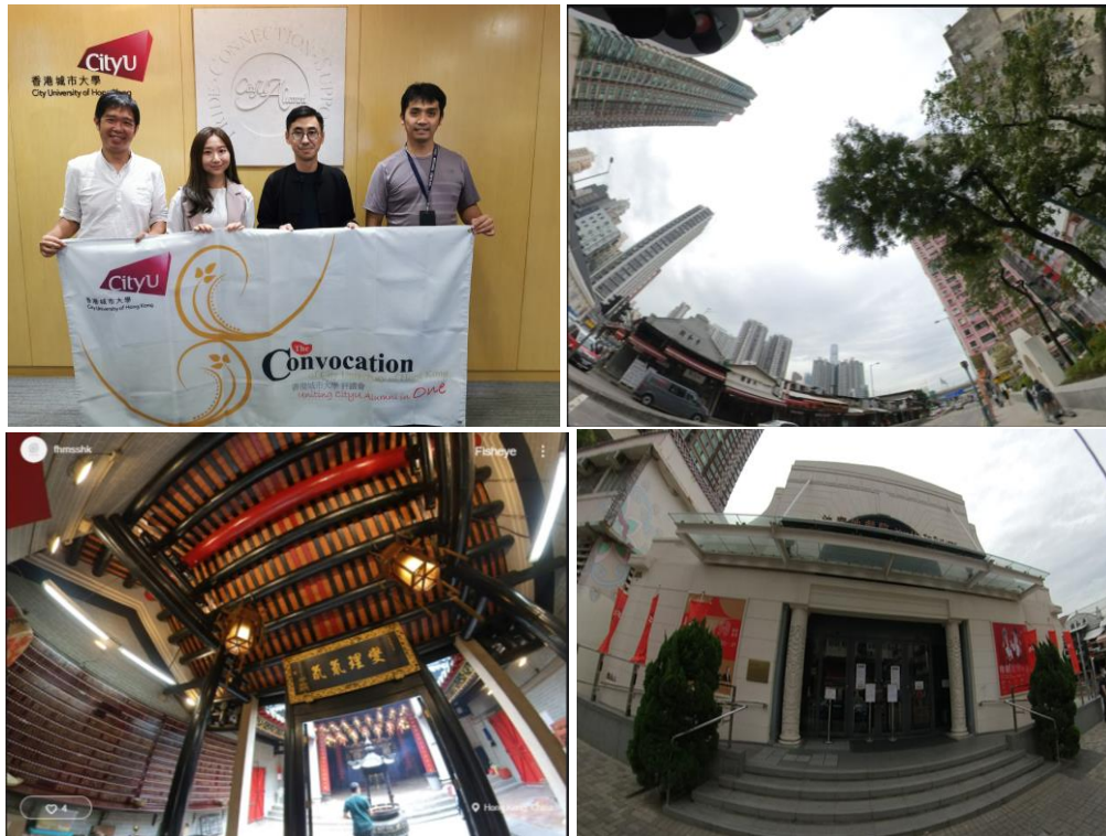
Alumni join a virtual tour to learn cultural heritage and landscape.